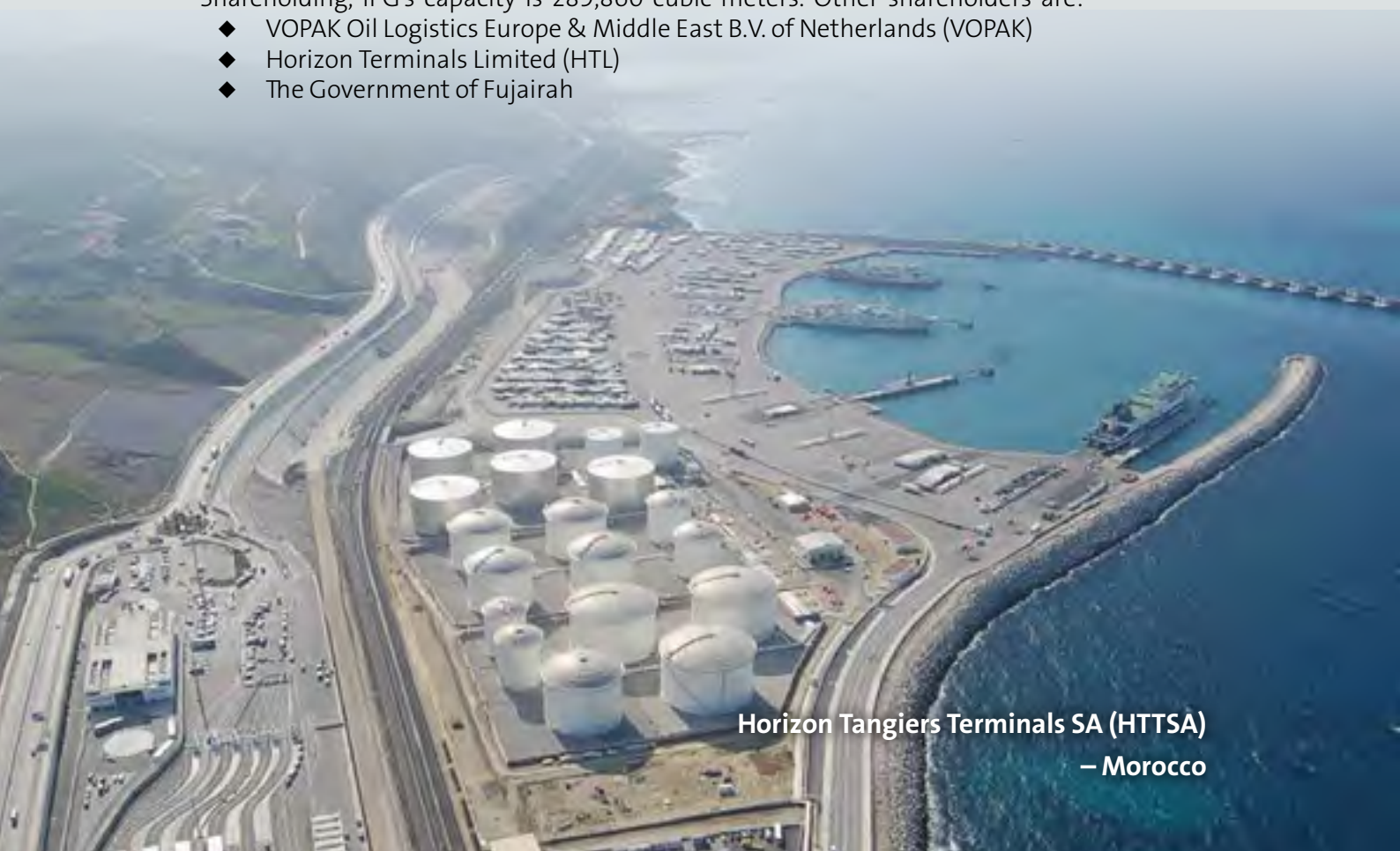
Horizon Tangiers Terminals SA (HTTSA) – Morocco