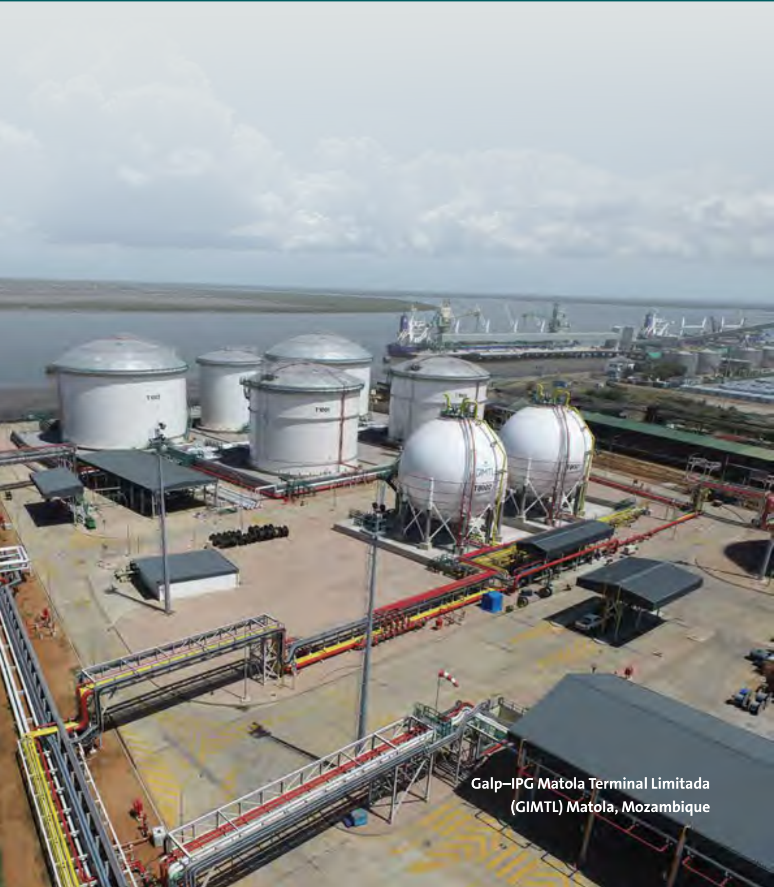
Galp-IPG Matola Terminal Limitada (GIMTL) Matola, Mozambique