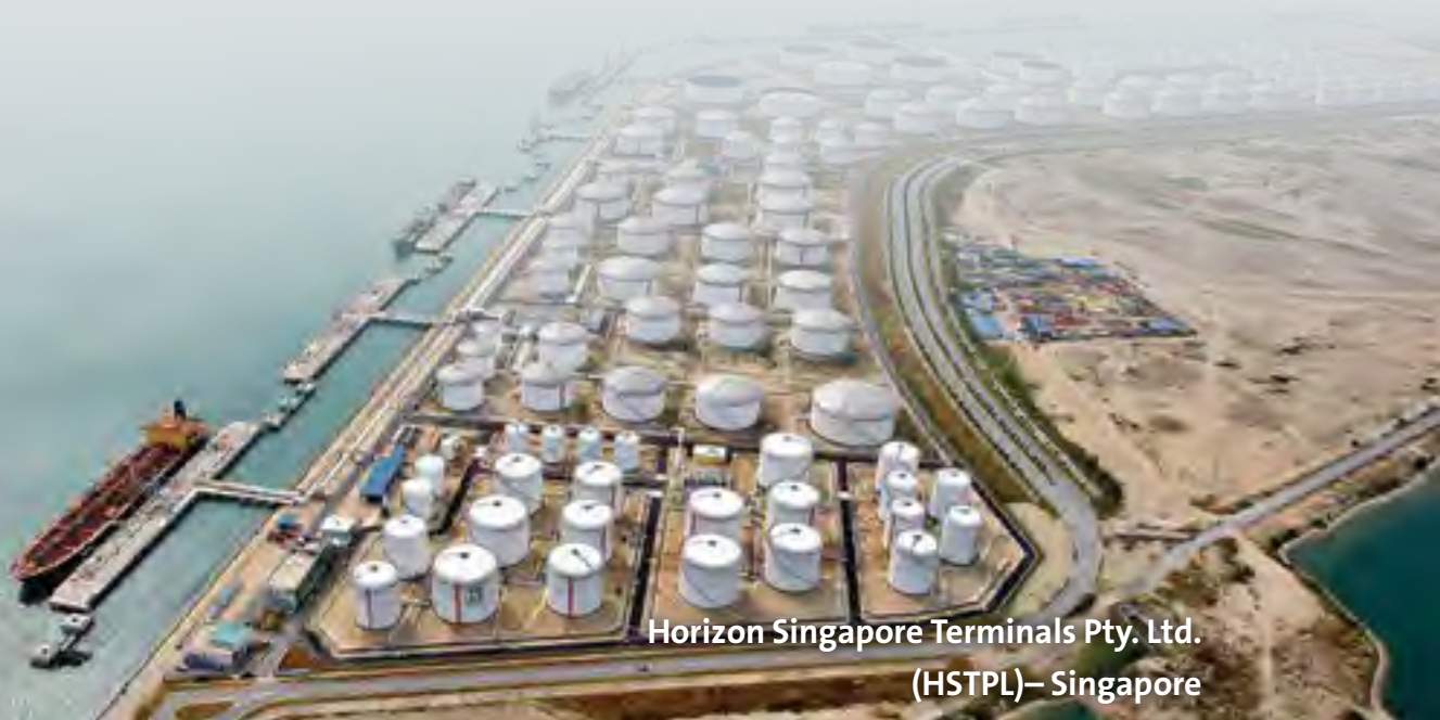
Horizon Singapore Terminals Pty. Ltd. (HSTPL)– Singapore