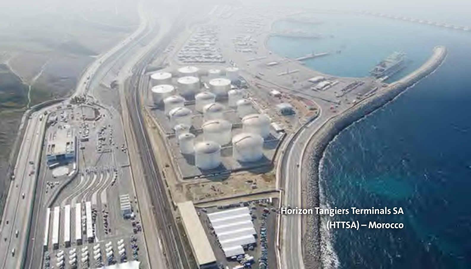
Horizon Tangiers Terminals SA (HTTSA) – Morocco

The Group's issued and fully paid-up capital is 18,840,750 Kuwaiti Dinars, consisting of 188,407,500 shares with a par value of 100 Fils per share.