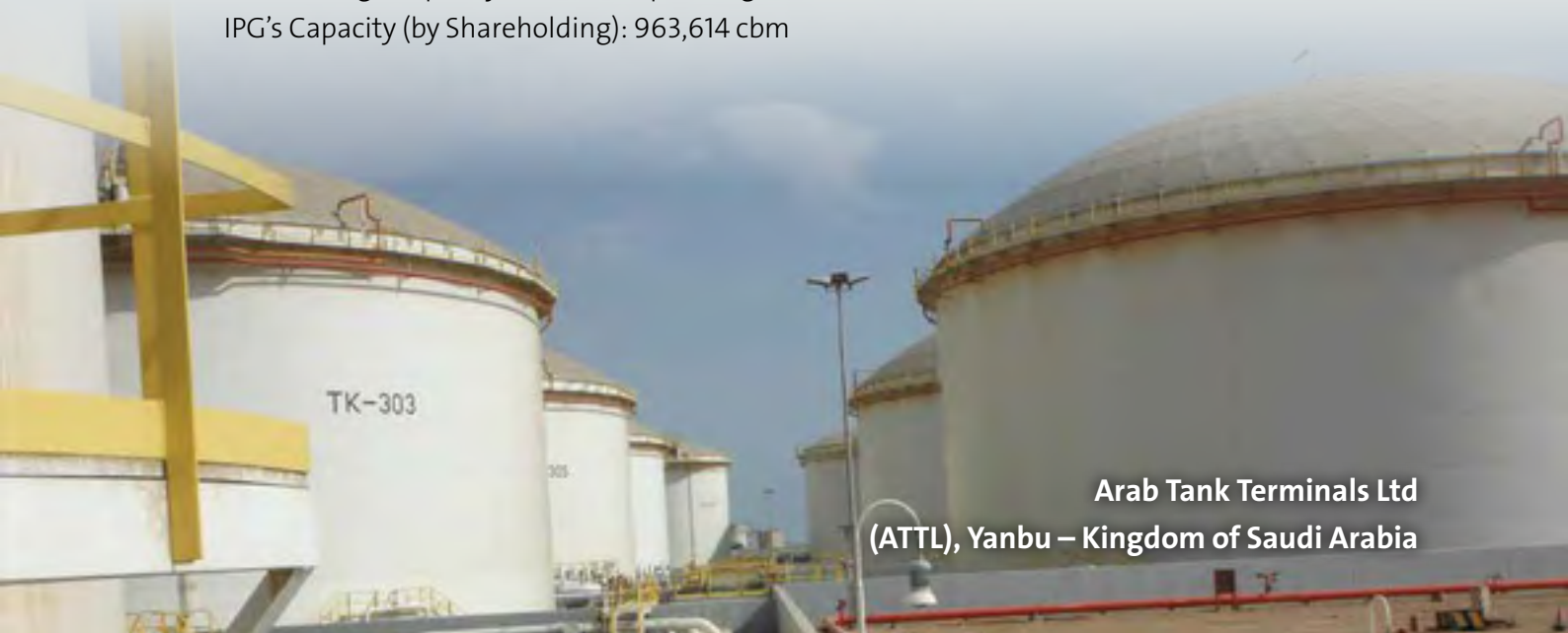
Arab Tank Terminals Ltd (ATTL), Yanbu – Kingdom of Saudi Arabia

IPG's Capacity (by Shareholding): 963,614 cbm